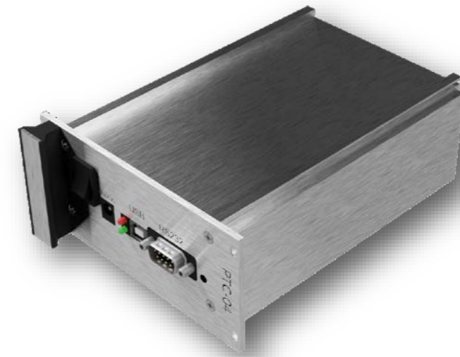
PTC-04 programming tool